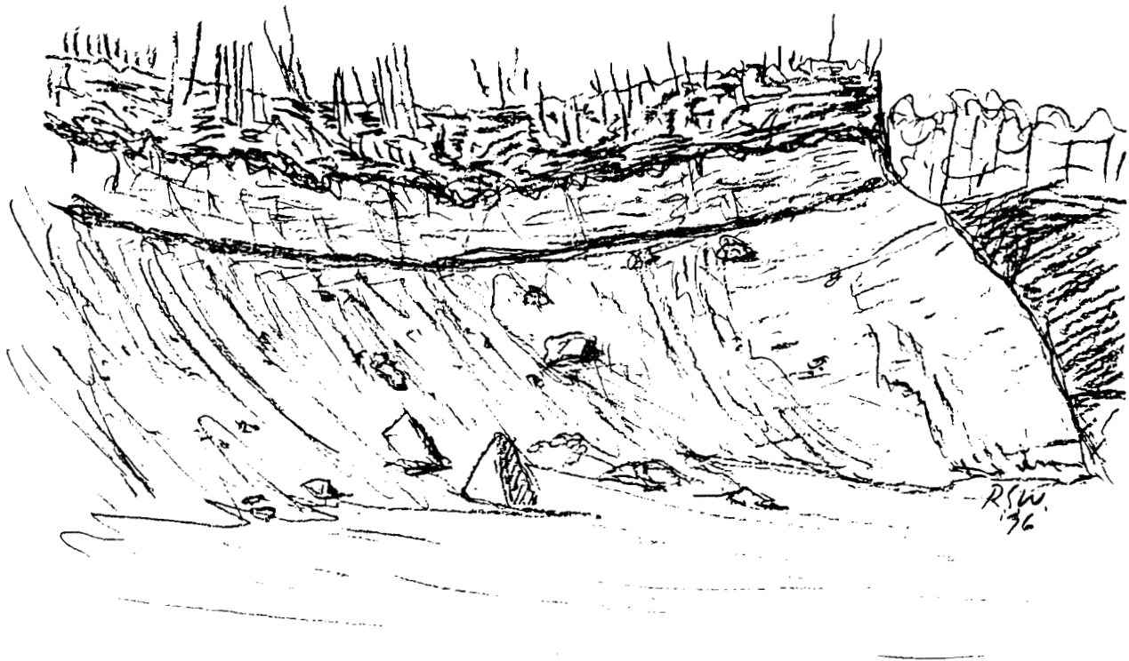
Erosionally Exposed, Late Pleistocene-to-Holocene Lacustrine Deposits in A Recessional Moraine at Ditch Plains, Montauk, New York.