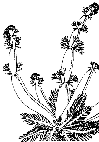
Featherfoil ( Hottonia inflata ) A bizarre aquatic species in the Primrose Family