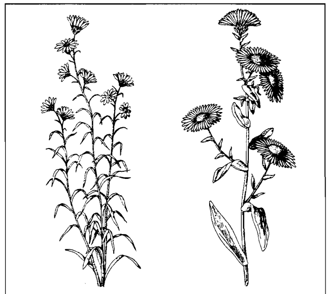
Sickle-leaved Golden Aster (left) and New York Aster

The rarest September flower of all in New York State is the sandplain gerardia ( Agalinis acuta ) of Montauk and a few other spots on Long Island and coastal New England. This small, pink-red flowered annual once covered the grasslands of Montauk from the ocean to Block Island Sound. No longer. There are just a few left.