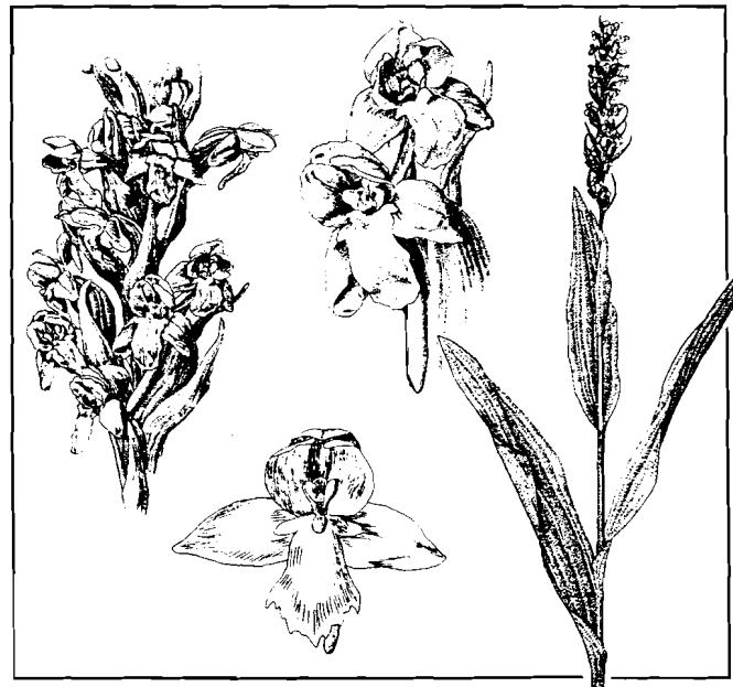
Northern Tubercled Orchid

Earlier this season (1999) as I conducted a field check to determine the rate of sprout of the Phragmites population after last year's management work, I noticed orchid leaves coming up in a section of the meadow. Until this season, this section contained a moderately dense stand of Phragmites