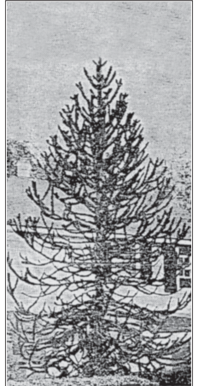
Monkey-puzzle tree on Erland Avenue, Stony Brook as it appeared in Newsday , 1967. By 1999 the same tree had lost most of its lower branches and its crown was nearly flat-topped.

MITCHELL, A. 1974. Trees of Britain . Houghton Mifflin Company, Boston