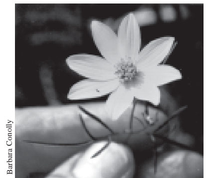
Northern Tickseed Sunflower