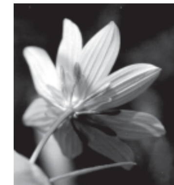
Northern Tickseed Sunflower

Fifteen people set off under the guidance of Chris Mangels, happy to have him back on Long Island for a visit. He first showed us a few large specimens of post oak ( Quercus stellata ) and then two species of bead grass, one of which ( Paspalum laeve ) is a New York State element. In a field lush with slender fragrant goldenrod ( Euthamia tenuifolia ), sheep's bit ( Jasione montana ) showed up along with orange grass ( Hypericum gentianoides ), not to mention ten kinds of butterflies. But the gem of the day was the northern tickseed sunflower ( Bidens coronata ) growing up to four feet tall out in the fen - a freshwater narrow-leaved cattail marsh adjacent to a salt marsh. Also growing there were cross-leaved milkwort ( Polygala cruciata ), cotton grass ( Eriophorum virginicum ), freshwater cordgrass ( Spartina pectinata ) and meadow beauty ( Rhexia virginica ).