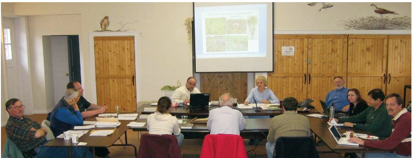
Figure 1. Members of the SRC at the April 1, 2009 meeting.