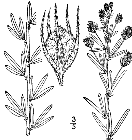
Lespedeza angustifolia (Pursh) Elliot - narrowleaf lespedeza Britton, N.L., and A. Brown. 1913. An illustrated flora of the northern United States, Canada and the British Possessions . Vol. 2: 407.

Mike Feder first encountered G. purpurea in 2007 when he saw four individuals in Queens County. In 2008 and 2009, Mike observed it growing in at least 30 separate localities, mostly in the Forest Hills area, but also in Flushing, Sunnyside, and even one individual plant in Central Park. Individuals usually occur singly in unmowed areas between sidewalks and streets and also in weedy lawns; but larger colonies of at least 10 to 15 individuals also have been observed. In southeastern states G. purpurea usually occurs in fields, roadsides, pastures, and waste places; similar to the habitat that it is colonizing on western Long Island. This apparent rapid northern range expansion has been also observed in other species such as Eupatorium serotinum and Heterotheca subaxillaris .