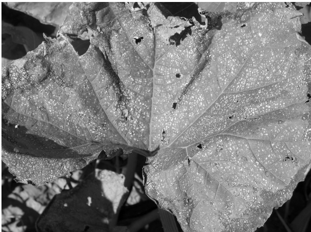
Figure 1. Pumpkin leaf affected by ground level ozone.

My colleagues and I have identified an alternative method for investigating ozone impact that entails comparing two lines or clones of a plant that differ in sensitivity to elevated ozone but have similar productivity when ozone levels are low. To date we have developed two systems--one with white clover and another with snap bean. For the clover system, plants are grown outdoors in pots. Impact of ozone on the productivity of the sensitive clover is estimated by cutting leaves off every four weeks and comparing the dry weight of leaves from the sensitive clover to that of the tolerant clover. The beans are grown outdoors in the ground. Both fresh market and mature yield are measured by removing pods from some plants every