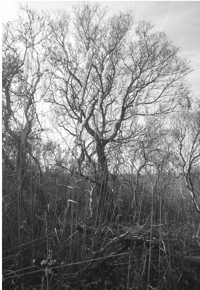
New York State Champion Northern Bayberry, Lido Beach Marine Conservation Area.

As we walked along the trail, I noticed what appeared to be some fairly tall shrubs with a good number of persistent leaves.