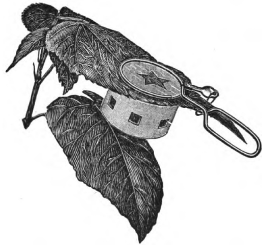
Figure 3. A Simple Normal Light Screen (Ganong 1910b). This laboratory device allows light to hit only that area of the leaf within the star-shaped window, where photosynthesis will occur and starch will accumulate.

thinking?” he asked (Whitney 1930). Unfortunately, by that time, there were actually not many teachers of botany left to answer his call. For sometime during the 1930s, botany ceased to be taught as a course separate from general biology. By 1936, with textbooks no longer in print, the College Board dropped the botany examination altogether.