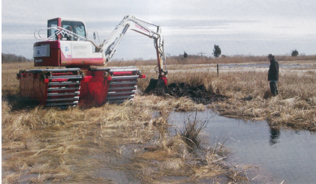
Figure 5: To fill a ditch, excavators must find a source of fresh peat. So peat is excavated from intact high marsh. In the process, new ponds and ditches are dug. Areas scouted for peat removal are those that are wet with puddles or small pannes. From Figure 21, page 91 of the Memoirs

Mary Laura Lamont who served as official representatives from the Townships of East Hampton and Riverhead, respectively. Historically, the politicians of the Suffolk County Legislature enforced the recommendations of the CEQ.