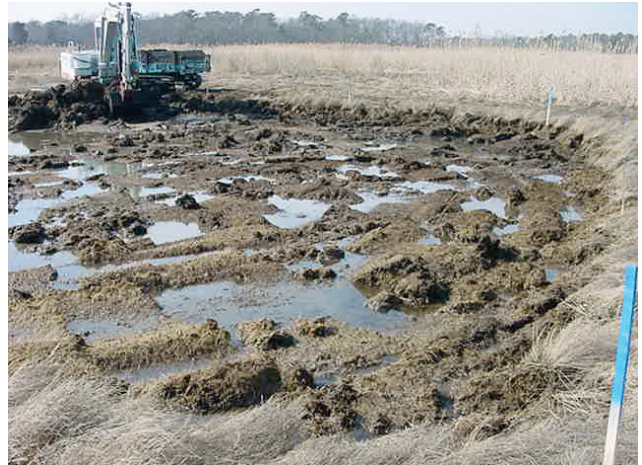
Figure 4: High marsh, vegetated with Spartina patens , is chosen to be sacrificed in the OMWM excavation. Note that the invasive Phragmites australis is left in place. From Figure 16, page 130 of the Memoirs.