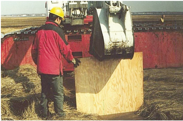
Figure 2: A piece of plywood being knocked into a ditch with the bucket of a backhoe. The plywood acts as a plug. The blocked ditch ceases to serve as an artificial channel for marsh drainage, and as a result, large ponds can form on the marsh (behind the blocked portion of the ditches). Figure 39, page 140 of the Memoirs.