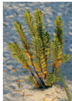
Figure 6. Young Florida rosemary ( Ceratiola ericoides ) [MVC].

On Tuesday, it was back to Sanibel and onto the five-mile drive at Ding Darling, the National Wildlife Refuge there. Though the roseate spoonbills had left for nesting duties, a large bunch of white pelicans remained on a sand bar with shorebirds.