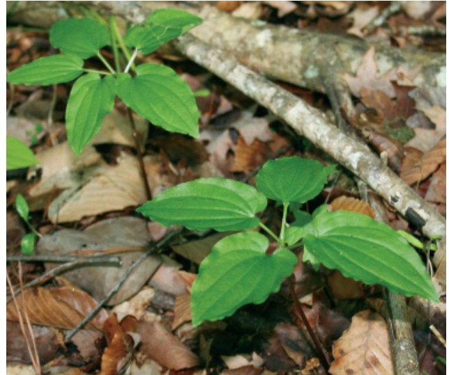
Figure 15. Croomia pauciflora [MVC].

Croomia ( Croomia pauciflora ) is a rare spring ephemeral of the southern coastal forests of the U.S. and the only member of the Stemonaceae to occur in the Western Hemisphere. With net-veined leaves and flower parts in multiples of four, members of the Stemonaceae are unique among the monocotyledons.