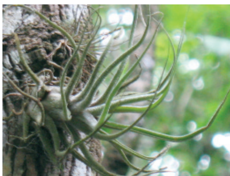
Figure 9. Fuzzy wuzzy airplant ( Tillandsia pruinosa ) [EL].

After lunch Mike led us about six miles into the Strand on Janes Scenic Drive. We parked our vans and followed him along a