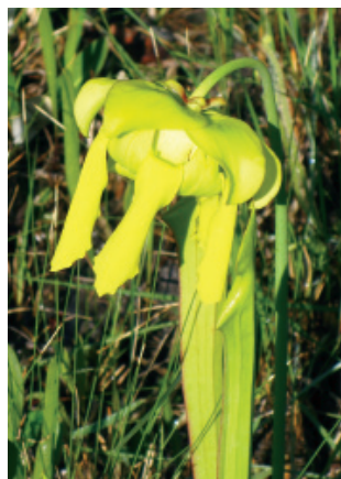
Figure 23. Flower of Sarracenia flava (yellow pitcherplant) [BC].

One of our very best days was the following day at Apalachicola National Forest. We hit a pitcher plant bog and saw pitcher plants and sundews that were new to many of us [Fig. 23]. As we moseyed around looking at the bog plants Eric Lamont decided to do some off-site tramping and he soon let out with a shout that he had a cottonmouth in attack mode – or words to similar effect. Being a snake enthusiast myself, I rushed over to see