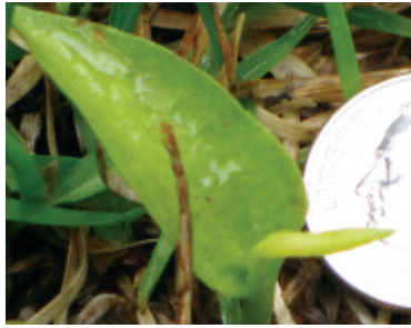
Figure 1. Ophioglossum petiolatum [BC].

The big surprise when we reached the Holiday Inn at Sebring were nearby vacant lots which yielded a fantastic number of scrub plants. An Ashe's calamint ( Calamintha ashei ) in full bloom [Fig. 5] there so moved Elaine Jacobsen (it was her birthday)