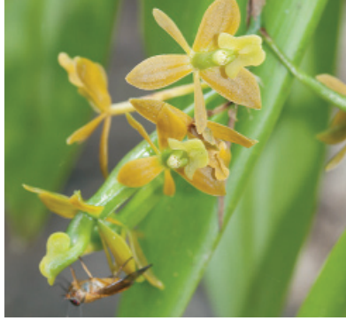
Figure 26. Epidendrum amphistomum (big-mouth star orchid), seen at Fakahatchee Strand [JH].

be gracing the trees. With the help of our guides we had to look hard and learn how to identify orchid plants by their less showy parts. Only a few were in flower [Figs. 26 and 27] and they were not easy to see.