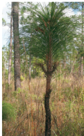
Figure 14. Long-leaf pine saplings look jaunty and comical [EL].