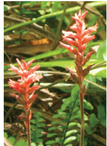
Figure 11. Sacoila (Spiranthes) lanceolata , scarlet ladies'-tresses [EL].

Our final day in the field was at Corkscrew Swamp, the Audubon sanctuary about 20 miles east of Naples which boasts the largest collection of old-growth bald cypress ( Taxodium distichum ) in the country.