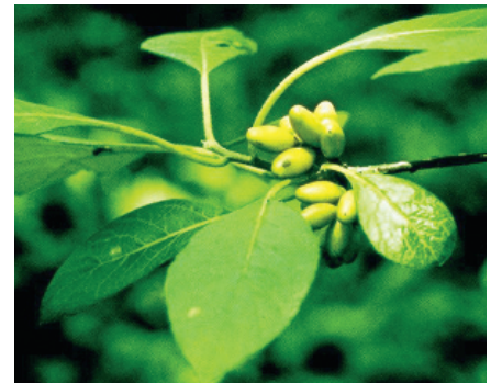
Figure 19. Fruits of Leitneria floridana [Gil Nelson].

In other states it is found in widely varied habitats (Sharma et al. 2008), none of which, except for their swampy-ness, come very close to matching those found in Florida. These include, for