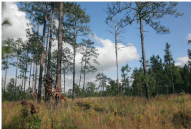
Figure 12. Savannah grassland of Torreya State Park.

Besides the grasses, especially Andropogon gyrans (Elliott's bluestem), and Myrica cerifera (wax myrtle), I was drawn to Darrow's lowbush blueberry, Vaccinium darrovii , with its tiny, very blue leaves, scattered here and there in the sunny, dry, park-like savannah.