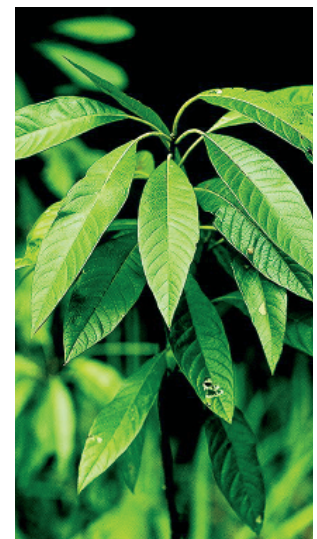
Figure 20. Leaves of Leitneria floridana [Gil Nelson].

The currently accepted fossil record of Leitneria extends to the early Oligocene. Fossils of the inner wall of the ripened ovary (endocarp) have been identified in the early Oligocene and Pliocene of western Siberia, as well as the Miocene and Pliocene of Europe (Dorofeev 1994; Nikitin 2006, both as cited in Clayton et al. 2009). It's tempting to speculate that Leitneria is a relic of a group of plants that grew in swampy areas around the shores of the epi-continental seas that gradually drained off North America (and Eurasia) during the Tertiary Period, most