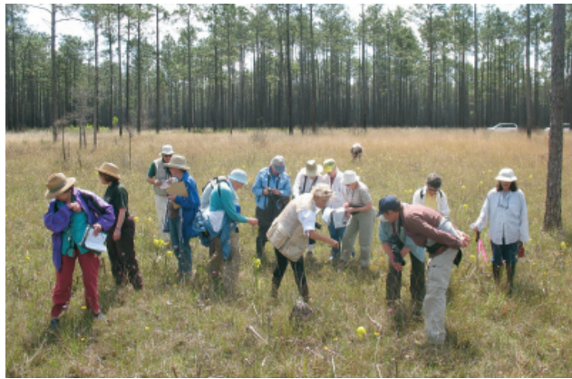
Figure 2. Botanists in a bog. Apalachicola National Forest.