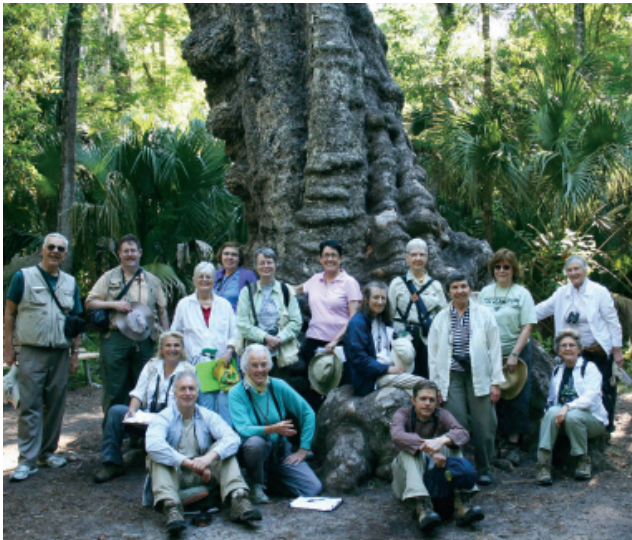
Figure 7. At Highlands Hammock State Park, near a 970 year-old live oak ( Quercus virginiana ) [Ranger Rick].