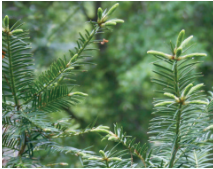
Figure 22. Buds and branches of the Florida Torrey ( Torreya taxifolia ) [MVC].

We had barely left the Tallahassee Airport on our way to the motel in Blountstown when we passed a group of churches, and I knew we had hit the Bible Belt. We would also see another cluster of churches in