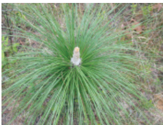
Figure 13. Terminal bud of long-leaf pine sapling [EL].