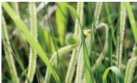
Figure 3. Dew-threads sundew ( Drosera tracyi ) [MVC].

Sunday morning we rendezvoused with Ranger Rick at Highlands Hammock State Park. There we surrendered all our cameras to him in order to be photographed in front of a 970 year-old live oak ( Quercus virginiana ) [Fig. 7]. Our smiles turned to gasps as we watched Ranger Rick's big white sneaker obliterate Carol Johnston's camera on the ground. (Happily, Carol was reimbursed for her loss very quickly.) Subsequently we walked a Cypress Swamp trail where lizard's tail ( Saururus cernuus ) was in full bloom.