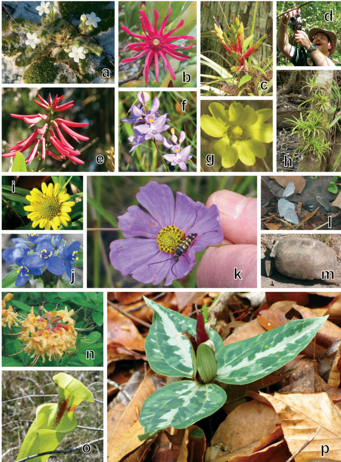
Figure 28. A sampling of photographs taken by LIBS members: