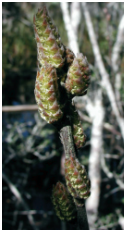
Figure 17. Male catkins of Leitneria floridana [AFJ].

During our Florida trip, LIBS members made a detour on their way to Perry for a look at Leitneria floridana (Florida corkwood), a peculiar shrub growing in swampy woodlands near the coast in the Big Bend area of Florida (Figure 16). The species name honors Edward Leitner, a nineteenth century German naturalist, and the common name refers to the local use of the light wood as floats for fishnets 1 . Leitneria is clonal, deciduous, and relatively unbranched—in winter it looks like a bunch of sticks stuck in the middle of mucky depressions, often growing with sawgrass ( Cladium jamaicense ) or Walter's sedge ( Carex striata ), in the live oak-cabbage palm forests near the coast. The sticks develop catkins in late February and each clone generally has either male (yellowish) or female (reddish) catkins (Figures 17, 18). Fruits (Figure 19) and leaves (Figure 20) develop in late March. Its unbranched form and large leaves clustered at the top of the stem have earned it the nickname “leaves-on-a-stick.” Besides shady woods ponds, it can also occasionally be found in open, sunny sawgrass marshes where it is subject to regular fires, after which it re-sprouts vigorously.