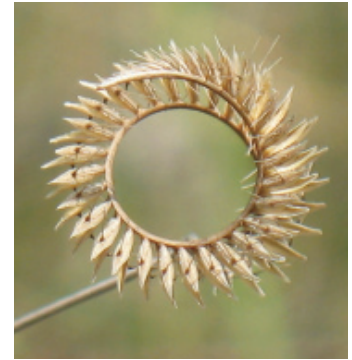
Figure 4. Toothache grass, Ctenium aromaticum . Inflorescence from last year [EL].

we had been shown at Torreya! Who knew there were so many oaks?) on the nature trail, besides the tarflower ( Bejaria racemosa ), Garberia ( G. heterophylla ), sand spikemoss ( Selaginella arenicola ) and the tiny papery whitlow-wort ( Paronychia chartacea ). We were all amazed at the variety of endemic plants which thrive on that white sugar sand which is devoid of organic nutrients.