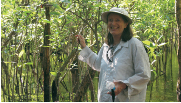
Figure 21. The author in a stand of Leitneria floridana in Florida [EL].

precipitously in the Oligocene. The shallow northeast arm of the Gulf of Mexico off the coast of Florida's Big Bend has been identified by geologists as one of the last of these seas (Davis 1997).