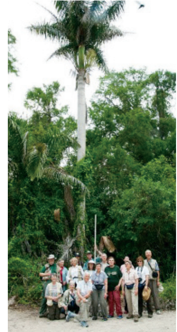
Figure 10. LIBS at the Fakahatchee Strand [JH].

tram line (a raised ridge constructed for the trains that carted the cut cypresses back to the depot during WW II.) There he showed us ten species of orchids of which three were in bloom, as well as the very rare bromeliad, Guzmania (G. monostachia) , [Fig. 28h] which resembled a cascade of healthy orchid-like leaves, cascading down a rotten log, and has so far escaped the predations of the [exotic] "Evil Weevil" which has demolished many large bromeliads. We wished it luck!