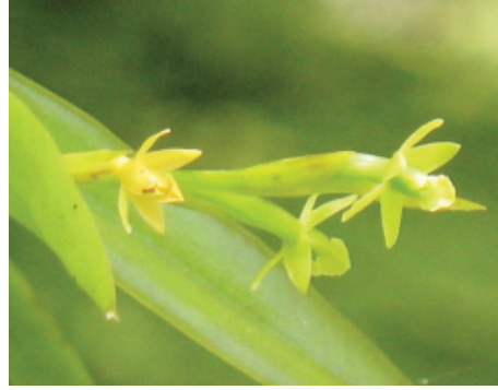
Figure 27. Epidendrum rigidum (stiff flower star orchid), seen at Corkscrew Swamp [EL].

Corkscrew Swamp was the most remarkable nature preserve I've ever seen. Within 2 ¼ miles of boardwalk—can there be anything else like it in the world? With all the wonderful plants