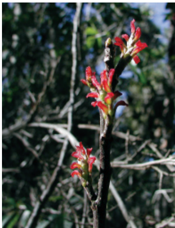
Figure 18: Female catkins of Leitneria floridana [AFJ].

Evidence that it is a relic species includes its widely disjunct distribution in small areas in Texas (S1 2 ), Arkansas (S2), Missouri (S3), Florida (S3) and Georgia (S1), as well as its taxonomic isolation. It has been classed as the sole representative of the order Leitneriales, the family Leitneriaceae, and the genus Leitneria . Most recently it has been put in the Simaroubaceae within the Sapindales based on molecular evidence (Angiosperm Phylogeny Group 2003).