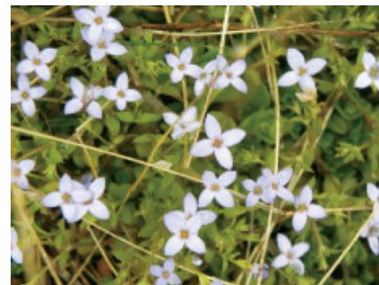
Figure 2. Houstonia pusilla at Heckscher State Park on April 23, 2011. Plants are ca. 3 cm tall.

On April 19, 2011, the first author returned to Jones Beach State Park and made collections of Houstonia pusilla from two locations (40°35'57.51"N/73° 28' 55.70"W and 40° 35'18.18"N/73° 33'26.82"W), and a collection of Oxalis exilis at one location (40° 35'51.50"N/73° 29'27.54"W). These specimens were deposited at the Brooklyn Botanic Garden on May 4, 2011.