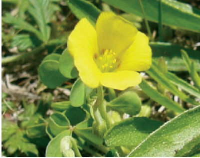
Figure 3. Oxalis exilis at Jones Beach State Park on April 19, 2011.