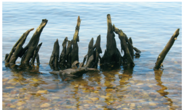
Figure 6. Submerged Atlantic white cedar stump in Flanders Bay at the mouth of Hubbard Creek.

In past geologic time when sea level was lower than today, Flanders Bay did not exist as an open body of salt water; rather it was a much narrower extension of the Peconic River, which currently empties into the bay approximately three miles to the west. At that time, the land we currently call Hubbard Marsh was upland, and the three current ponds were freshwater and hydrologically connected to Hubbard Creek which emptied into the Peconic River one to two miles further north. At that past time, several thousand (but less than 4700) years ago, the landscape at current Hubbard marsh must have resembled current day Sear-Bellows Pond Park with its coastal plain ponds and Atlantic white cedar swamps nestled within an extensive pitch pine-oak forest. As sea level rose, the ecosystems migrated landward, and that is why today we find a former white cedar swamp in a salt marsh bordering a shallow salt water bay.