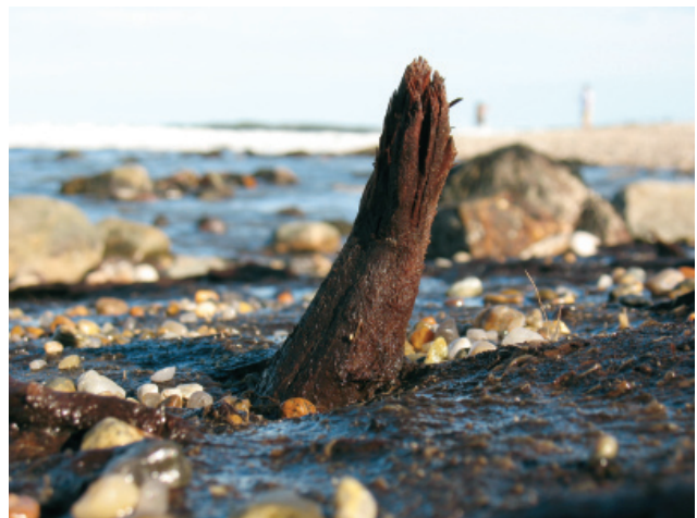
Figure 4. Atlantic white cedar branch protruding from the peat at Montauk Point.