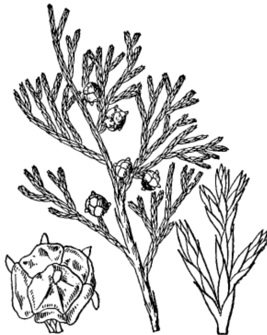
Figure 1. Chamaecyparis thyoides (Atlantic white cedar) [USDA-NRCS PLANTS Database / Britton, N.L., and A. Brown. 1913. An illustrated flora of the northern United States, Canada and the British Possessions. 3 vols. Charles Scribner's Sons, New York. Vol. 1: 65.]

Laboratory examination of the peat revealed the remains of plants, including leaves, grasses or sedges, and pieces of tree trunk. Some of the washed-ashore peat was attached to tree roots. The tree-trunk remains were identified as Atlantic white cedar, and brought to a carbon-14 dating lab at SUNY-Stony