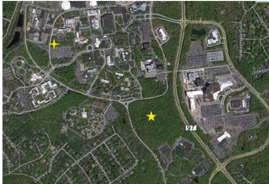
Figure 1. Location of study sites on the Stony Brook University campus. The yellow five-pointed star identifies the Ashley Schiff Park Preserve, location of soil-pH and leaf-collection sampling. The four-pointed star is the location of cation exchange capacity (CEC) analysis of soil.

Wherry (1923) studied the plant distributions and the pH of soil in a deciduous forest in Locust Valley some 40 km west of the Stony Brook University campus. This forest is