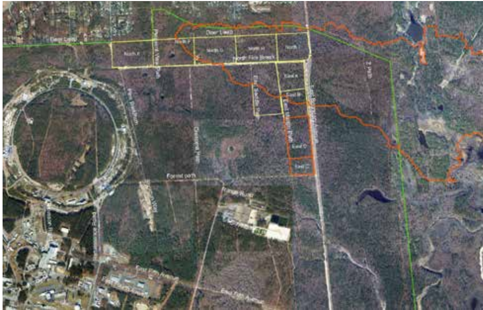
Figure 1. General aerial view of the Brookhaven Lab field trip area