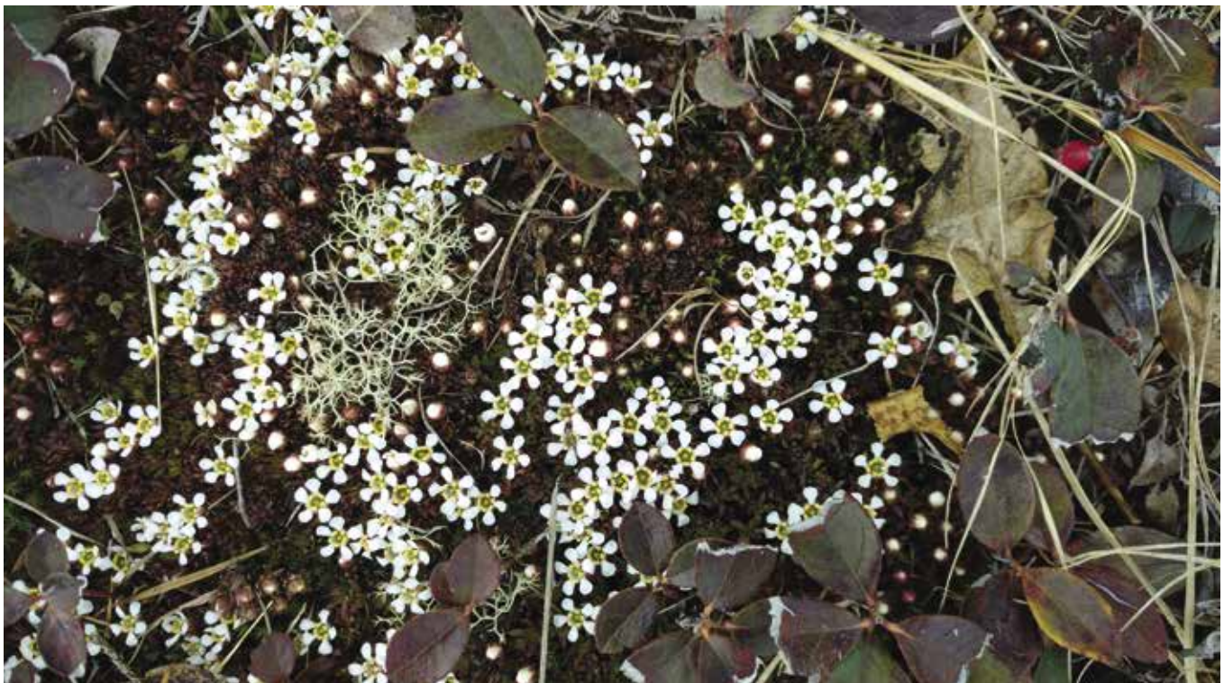
Figure 1. From bare soil to a complex ecological community in 22 years. This 2017 photo reveals the high plant diversity at the Freeman Avenue site. Pyxies have delicate white flowers and moss-like evergreen leaves. Interspersed among the pyxies (left of center) is a “reindeer lichen” known as Cladonia subtenuis. Encircling the pyxies is a ring of wintergreen (aka teaberry) plants ( Gaultheria procumbens), one with a red fruit. Dried needles of pitch pine ( Pinus rigida) and dried oak ( Quercus spp.) leaves decay and enrich the soil.

1 Chief Botanist, NY Natural Heritage Program, 2 Co-Chair, LIBS Conservation Committee