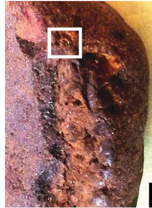
Plate 6. Carpolithus elongata sp. nov. (CAUM 180817-1. Possible pedicel scar is outlined in the white box. Scale is 1 cm.

A leaf assigned to Amelanchier is the only member of the Rosaceae that Hollick (1906) included in the Magothy flora of the northeastern U.S. The Bennington/Durso fossil of a putative rose hip, which I referred to as "Rosa," represents the first possibly rosaceous fruit (Greller 2008). Carpolithus slotnickii , described in the present paper, may represent the