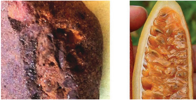
Plate 5. Carpolithus elongata sp. nov. (CAUM 180817-1; left); compared with a hand-held specimen of Passiflora tarminiana (rt). Scale is 1 cm.

Discussion. Hollick (1906) illustrated and briefly discussed a number of fossil fruits. Tricarpellites striatus , abundant in the Amboy Clays, but collected north of New Jersey only on Martha's Vineyard, is present as a cast in Glen Cove (Greller unpubl.). Ten species of Carpolithus are figured by Hollick (1906, Pl. VII). Four of these fossil fruits are distinctive enough to be assigned species names: Carpolithus euonymoides , C. hirsutus , C. vaccinioides , and C. floribundus . Hollick figured, as well, two species of "aments;" these he named Populus sp. and Myrica sp. One problematic Hollick genus is Williamsonia , with two species. These specimens may be infructescences of Magnolia , which is perhaps the most abundant angiospermous leaf fossil at Lloyd Neck.