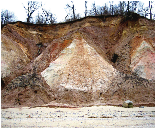
Figure 1. Cretaceous cliffs at Caumsett State Park, Lloyd Neck, Suffolk Co., N.Y.

3 Department of Philosophy, St. John's University, Jamaica, NY 11439