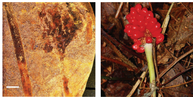
Plate 3. Carpolithus caumsettensis sp. nov. (CAUM 150526-7a,b; left) and an Arisaema triphyllum infructescence, for comparison (right).

Carpolithus elongata sp. nov., (CAUM 180817-1; Plate 5, left; Plate 6) was collected in 2018 on the beach at Caumsett State Park, our Lloyd Neck site. It is a cast which measures approximately 4 cm x 1 cm, at the edge of a limonite flat stone. The fossil is elongated and its dark outer portion is fragmented