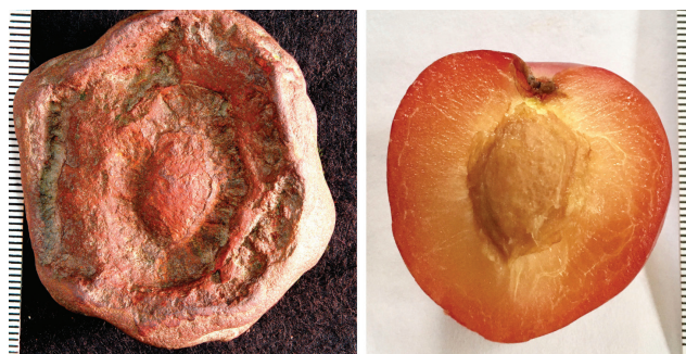
Plate 4. Carpolithus slotnickii sp. nov. (GP 180808-5; left); compared with a living fruit of Prunus cf. cerasifera (rt). Scale units = mm.

into a few segments. A small number of spherical objects sit at the center of this narrow specimen. The spherical objects are smooth in outline, and somewhat irregularly shaped. We can speculate that each sphere was fleshy. So the whole specimen can be interpreted as a group of fleshy seeds that are surrounded by a dark, fragmented wall, which is a few mm thick. We interpret this specimen as a berry. Among the berries of living angiosperms, we were drawn to a comparison with Punica granatum , the pomegranate. Here we see irregularly spherical, fleshy seeds contained in a leathery wall. The spherical shape and relatively large size of a pomegranate, however, are features not comparable to this small, elongate fruit. Passiflora was considered next, because its fruit also comprises a group of fleshy seeds that are enclosed in a relatively thick wall. A pictorial review of fruits of Passiflora species showed a remarkable similarity of our Cretaceous fruit to Passiflora tarminiana , the Taxo. Passiflora t. is a fruit indigenous to South America. A possible pedicel scar is indicated by a white square (Plate 6). Because no remains of a style can be identified, we cannot be absolutely certain this specimen is a fruit. Nevertheless, lacking any better interpretation, we are proposing that it be considered a berry, and comparing it with the Passiflora berry.