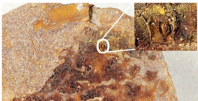
Plate 2. Carpolithus caumsettensis sp. nov. (CAUM 150526-7a,b), counterpart with an enlarged portion that shows a small unit of the limonite infructescence, one that contains a seed.

a seed. The seed appears to be whole; and the plane of bisection is close to medial on a coronal/frontal plane. Immediately surrounding the putative seed is a thick ring that shows radial banding. Peripheral to that band there is an amorphous ring that appears to contain veins with some attached flesh. The outer wall of this entire structure is very thin, serving only as a border. We interpret this specimen as a single, fleshy fruit, although we have not been able to identify a pedicel scar. A single-seeded fleshy fruit is a drupe. Among the drupes of living angiosperms, we were drawn to a comparison with a small plum, of which there are a few species in eastern North America ( Prunus spp.). When we made a vertical, coronal, nearly medial section of the fruit of a commercial Cherry Plum ( Prunus cerasifera variety) we were struck by the close similarity of our specimen in general morphology, seed form, endocarp and mesocarp anatomy. Applying the terminology of fruit morphology, we could describe the specimen as follows (from the center): seed, endocarp, mesocarp, exocarp. If we were comparing it to a nectarine ( Prunus persica ) we could use the terms: stone, seed shell, flesh, skin.