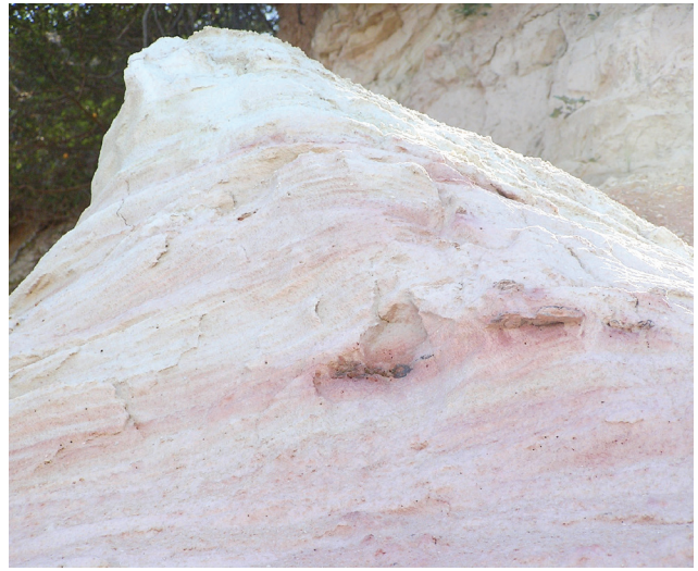
Figure 2. A section of Cretaceous cliffs that shows a stratum of red sand, containing limonite flat stones (Caumsett State Park, L.I., N.Y.).

Abstract. We collected three fossilized fruits that are new to the Magothy Formation, and new to science. They are from two Long Island, New York, sites. These fossils are named Carpolithus caumsettensis (Lloyd Neck site), a compression fossil; and Carpolithus slotnickii (Glen Cove site) and Carpolithus elongata (Lloyd Neck site). Both Carpolithus slotnickii and C. elongata are casts of limonite. Carpolithus caumsettensis is referable to the Araceae: Aroideae; C. slotnickii is referable to the Rosaceae: Amygdaloideae; and C. elongata is comparable to a species in the Passifloraceae ( Passiflora tarminiana ).