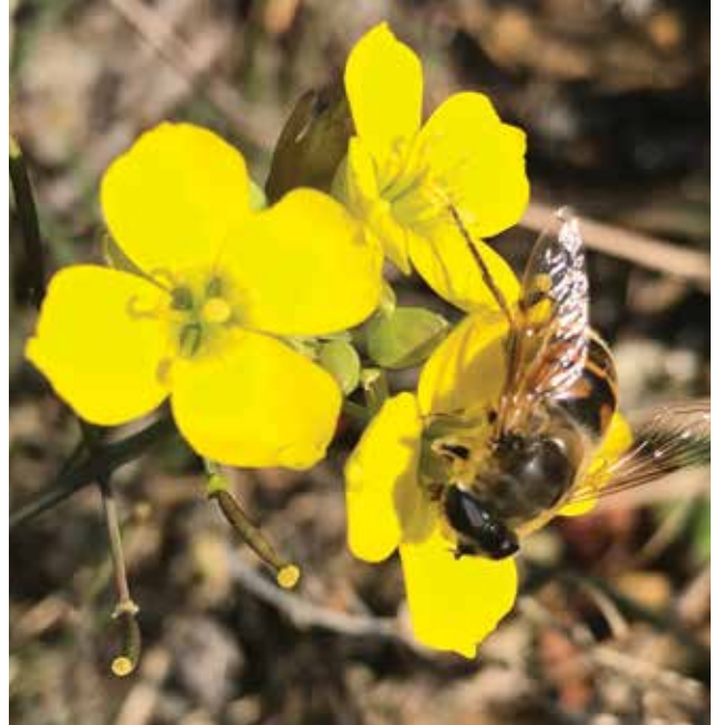
Figure 2. Sand rocket ( Diplotaxis muralis ) from Towd Point, Southampton Township, with mature flowers and developing fruits (siliques). The insect visitor, identified by Daniel Gilrein as a female drone fly ( Eristalis tenax ), was introduced from Europe around 1875 and is a mimic of the European honey bee ( Apis mellifera ). This type of mimicry is called Batesian mimicry because the mimic (not dangerous to predators) benefits because most predators avoid bees and wasps because they can inject toxins by stinging, so predators also avoid drone flies that are mistaken for bees and wasps. Photo by Vicki Bustamante, 2018.

Rare plant in New York (state rank: S2S3). In June 2019, Vicki Bustamante found a population of C. hormathodes in a marsh on the west edge of Oyster Pond behind the dunes of Block Island Sound, Montauk State Park, Suffolk Co. [voucher: 9 June 2019, V. Bustamante 1512 (NY)]. Species growing with C. hormathodes at this site include blue flag ( Iris versicolor ), common winterberry ( Ilex verticillata ), sallow sedge ( Carex lurida ), woolly sedge ( C. pellita ), common soft rush ( Juncus effusus ssp. solutus ), and swamp rose mallow ( Hibiscus moscheutos subsp. moscheutos ). Carex hormathodes occurs in brackish marshes and other maritime areas on rocks and sand often within reach of salt spray. There are 20 known populations of marsh straw sedge in New York and more than 20