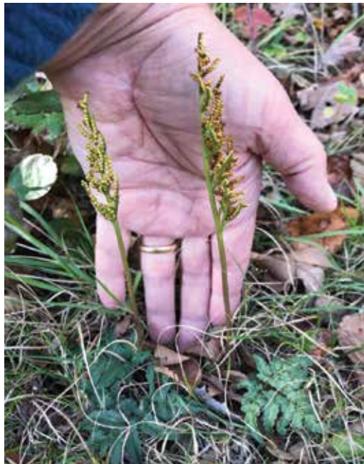
Figure 1. Blunt-lobed grape fern ( Botrychium oneidense ) at Montauk, Long Island.

New record for Long Island. For the past 100 years, this non-native annual grass from southeastern Asia has been spreading throughout eastern USA where it is invasive. Within three to five years it can form dense monotypic stands that crowd out and eliminate native, herbaceous vegetation. Arthraxon hispidus was reported from Bronx Co., New York as early as 1950 (Fernald 1950) and in 1990 it was still known in New