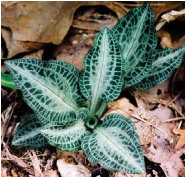
Figure 3. Basal leaves of downy rattlesnake plantain ( Goodyera pubescens ). The attractively reticulated, evergreen leaves of this orchid are a visual treat in any season.

Rare plant in New York (state rank: S1). This diminutive annual herb is at the northern limit of its range in southeastern New York where it has been rare but stable, with about the same number of populations, for the last 100 years. Historically, in New York it occurred only on Staten Island, Long Island, and Bronx and Westchester counties. Currently, there are 10 known populations in New York, all in Suffolk Co.; only three of the 10 populations have more than 200 individuals. There are three historical populations from the early 1900s that have not been resurveyed. In August 2018, Vicki Bustamante found a population of clustered bluets in a wet, sandy opening near the shoreline of Big Reed Pond, Montauk County Park, East Hampton Township, Suffolk Co. [voucher: 11 Aug 2018, V. Bustamante 1366 (NY)]. Species growing with E. uniflora at this site include autumn fimbry ( Fimbristylis autumnalis ), grass-leaved rush ( Juncus marginatus ), slender yellow-eyed grass ( Xyris torta ), cross-leaved milkwort ( Polygala cruciata ), and brownish beak sedge ( Rhynchospora capitellata ). This species has been placed in three different genera during the past 30 years: Hedyotis (Gleason and Cronquist 1991), Oldenlandia (Werier 2017), and Edrastima (Weldy et al. 2020).