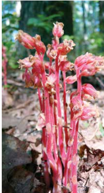
Figure 4. Red pinesap ( Hypopitys lanuginosa ). Pinesaps are mycotrophs, receiving nutrients via fungal mycelia rather than through photosynthesis.

Juncus scirpoides var. scirpoides , sedge rush (Cyperaceae the Sedge Family). Native.