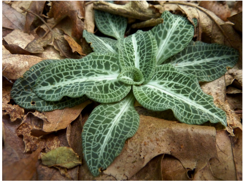
Figure 3. Rosette of veined, evergreen leaves of downy rattlesnake plantain ( Goodyera pubescens ). This orchid has the most handsomely marked foliage of any of our native orchids.

No plants have yet turned up in my searches of Queens County despite several reliable records and personal communications with individuals intimately familiar with the parks located along the glacial moraine of Long Island in this most populous New York City borough.