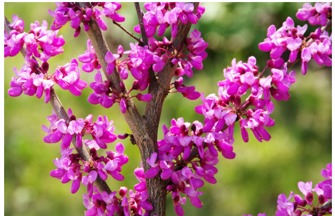
Figure 1. Redbud ( Cercis canadensis var. canadensis) in flower. The bright pink, pea-like blooms produced in the spring, before leaf-out, give redbud its name.