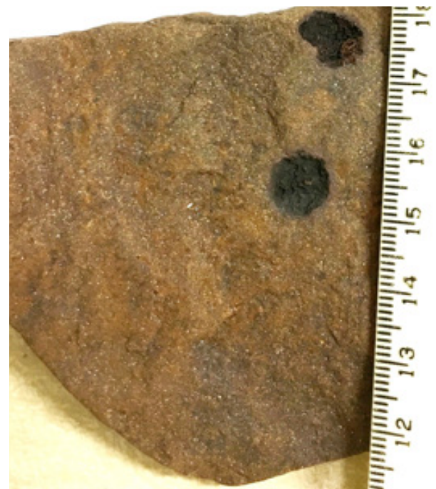
Figure 2. Fossil CAUM 160628-1 AMG. Putative berries (Caumsett State Historic Park Preserve, collected June 28, 2016).