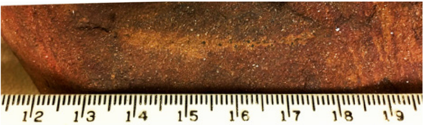
Figure 4. Fossil CAUM 180817 AMG. (Caumsett State Historic Park Preserve, collected August 17, 2018) Putative "staminate ament."