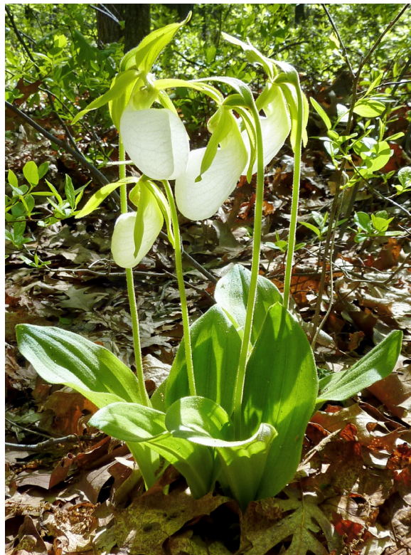
Figure 1. Albino pink lady's slipper ( Cypripedium acaule forma albiflorum ) from western Suffolk County. The white-flowered form is more frequent northward. What is causing the recent decline of the albino form on Long Island? Climate change? Is Long Island getting too warm to support northern species?

But nature's beneficence faded with the advancing season, and here, less than three months later I was surrounded by limp plants, parched soils, and fallen leaves; prematurely yellow and red, covering the strange phthalogreen of dried woodland mosses. Among the ruins, six rosettes of Goodyera pubescens – the evocatively named “Rattlesnake Plantain” orchid – hung on. In fact, though the plants in this small colony hadn't flowered in 2022, the leaves seemed unusually healthy; cameoed against the dried soils, their leaves still stiff and healthy, the usual velvety blue-green and white.