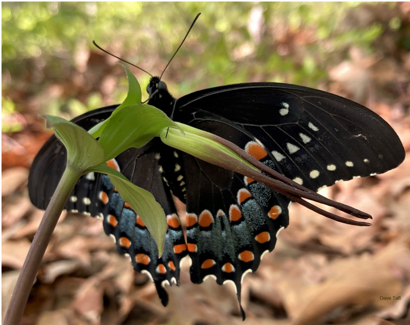
Figure 4. Dark phase of an eastern tiger swallowtail (female) visiting the flower of large whorled pogonia ( Isotria verticillata ).

carefully bagged “gifts” throughout the site, waiting for absent maintenance staff to clean up. At least as troubling, the once dominant canopy of white pine ( Pinus strobus ) has diminished, allowing far more light penetration to the woodland floor. This affords invasive, non-native species more light, and a toehold in the poor soils. In my experience, this form of vegetative competition is often the final chapter for Long Island orchids. Scattered, small colonies, such as the one I reported on in my 2013 article, along the Northern State Parkway still cling to life, even flowering occasionally. This site has fluctuated between two rosettes and six over the last several years, there was one flowering spike in 2021, none in 2022.