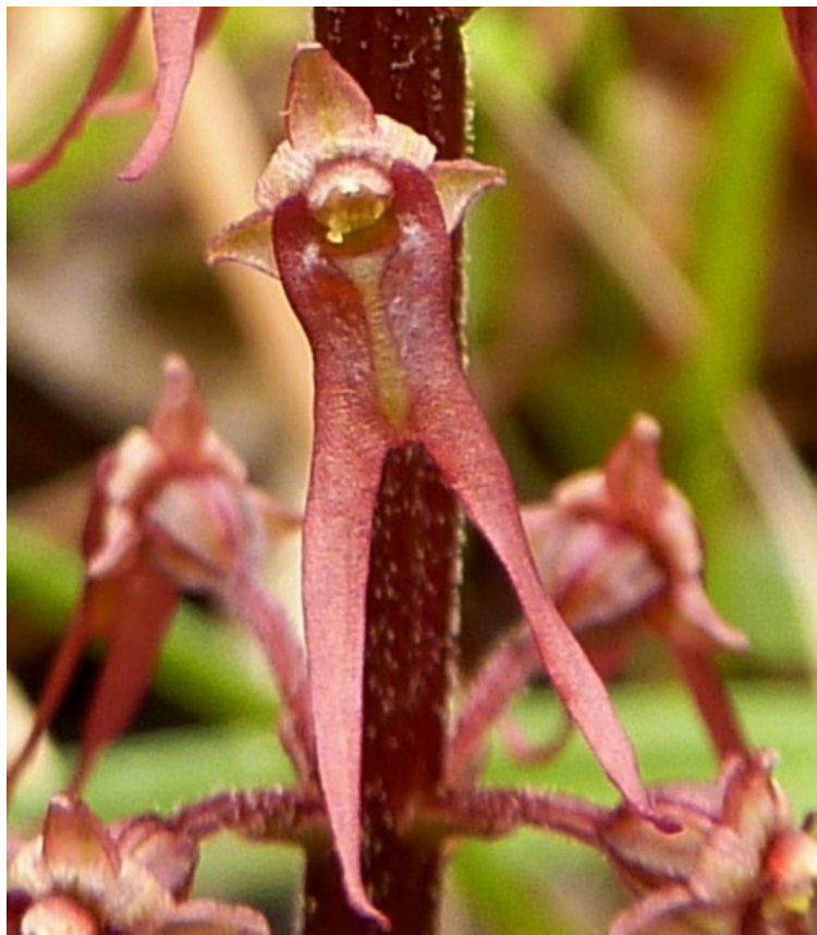
Figure 5. Southern twayblade ( Neottia bifolia , aka Listera australis ). Close-up showing flower's two-lobed lip. This orchid is very rarely observed due to its small stature, inconspicuous nature, and inaccessible habitat preference. "These tiny little plants blend into their surroundings so well that they are almost impossible to spot when walking through the woods. Because the flowers and stem are the same color as the leaf litter and act as a great camouflage, I have found the best technique for spotting them is to look first for a pair of shiny, dark green leaves" (Jim Fowler, 2005).

All is not lost for this species on Long Island however. The discovery by Polly Weigand of a single individual of M. unifolia at a well-protected site within the Sayville Grasslands led to a survey by Steve Young and me in July of 2015. The survey revealed a large population of M. unifolia at a very atypical site. Initial numbers were impressive at a conservative 208 plants. The conditions here seemed quite different than the usual locations for this species, essentially a relatively dry, sandy field with crustose soils, the orchids sprouting in the interstices between grasses and other herbaceous species; quite unlike the shaded damp areas where the plant is often found. The strong possibility of the orchid being the closely related Malaxis bayardii was considered and eventually dismissed, however, the habitat is far more similar to the latter's typical preferred habitat.