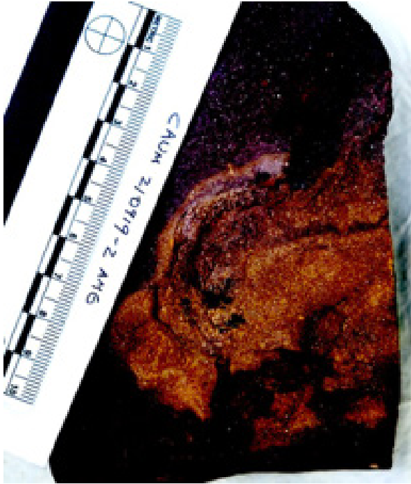
Figure 3a. Fossil CAUM 210919-2 AMG (Caumsett State Historic Park Preserve, collected September 19, 2021).