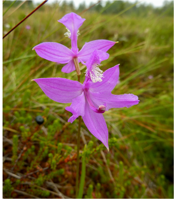
Figure 2. Grass pink ( Calopogon tuberosus var. tuberosus ). This orchid is worth seeking out as one of our showiest wildflowers. "Coming across a clump of these beauties will surely open your eyes" (Jim Fowler, 2005).

One of the most peculiar native plants on Long Island, the achlorophyllous 1 , mostly cleistogamous 2 Corallorhiza