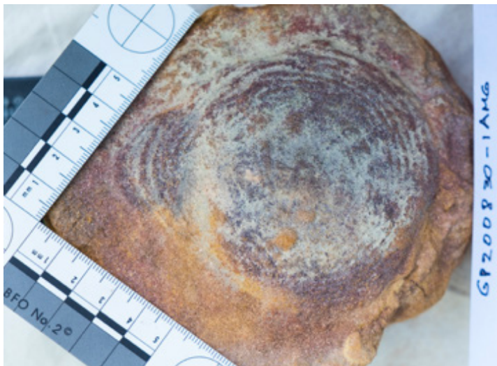
Figure 1. Fossil GP 200830-1 AMG. Tree trunk cross-section (Garvies Point, collected August 30, 2020).

Specimens were gathered from the beach, having been eroded from the cliffs by rain. Some specimens appear to have been sorted by the tides and moved westward from their points of deposition. The first author has been collecting fossils at Caumsett State Park under permits issued annually by New York State. All collections have been deposited at the New York State Museum in Albany, N.Y.