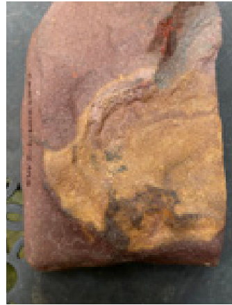
Figure 3b. Fossil CAUM 210919-2 AMG (Caumsett State Historic Park Preserve, collected September 19, 2021); and compared with the pedicel and lower portion of the fruit of Curcubita okeechobeensis (Cucurbitaceae).