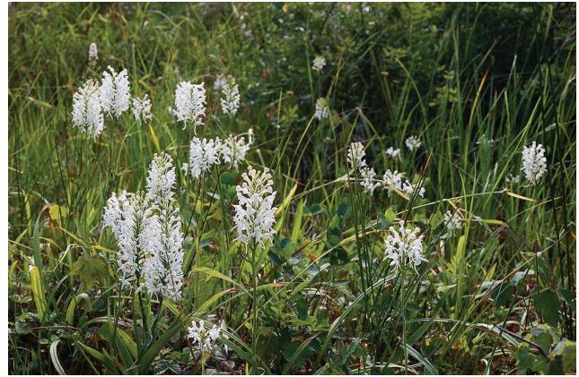
Figure 6. Northern White Fringed Orchid ( Platanthera blephariglottis var. blephariglottis ). a. (above) colony in a wet meadow, b. (right) inflorescence.

Suffolk County is home for the species at several sites. One of the best known is within the Quogue Wildlife Refuge. Here, a small wet meadow which always hosted the orchid (as well as several other state rarities) has been the subject of several volunteer clearings over the past two decades. The site had a banner year in 2011 with 123 plants in flower (hard to estimate the true number of plants present as the sterile leaves are most often obscured by a variety of other